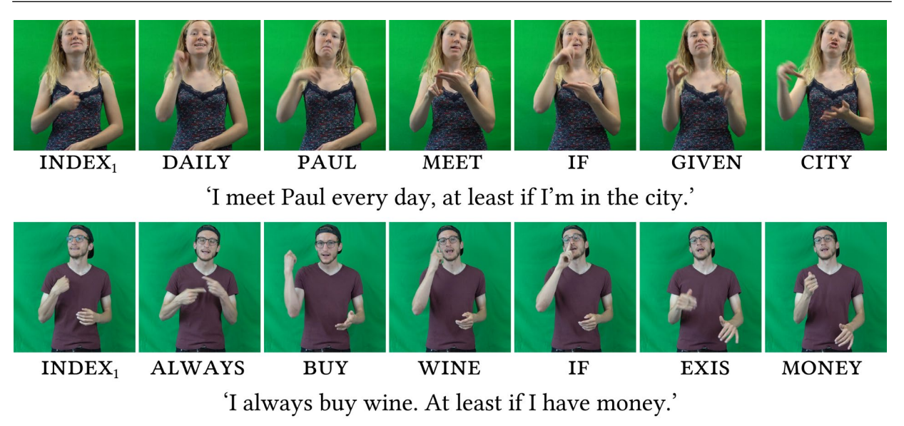
Figure 9. With the qualifying use an eyebrow raise was produced on the manual subordinator.

(26) a. INDEX<sub>1</sub> ALWAYS BUY WINE IF INDEX<sub>1</sub> MON-EY EXISTENTIAL 'I always buy wine. At least if I have money.' b. INDEX<sub>1</sub> DAILY PAUL MEET IF GIVEN CITY