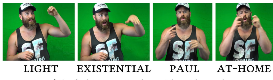
'The light is on. Paul must be at home.'