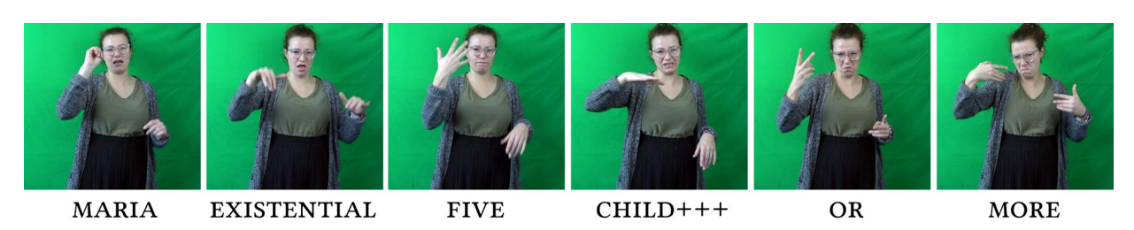
'Maria has at least five children.'

As shown in the example, there is no particular marking of the 'at least' clause itself. It seems like it is not possible to use non-manuals to indicate a positive evaluation – this finding is as previously