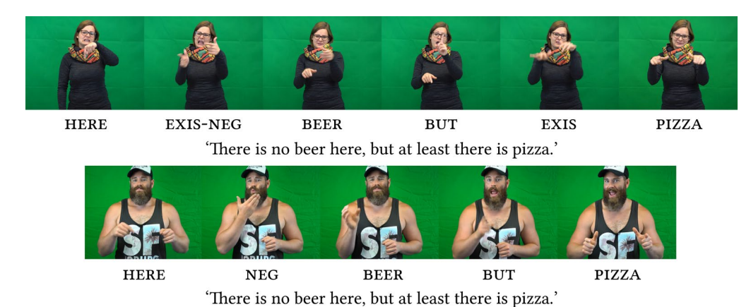
Figure 8. Representative images depicting two examples of the concessive use of 'at least'. The top row shows an example without an additional evaluation accompanying the 'at least' clause and the bottom row shows an example with a slight positive evaluation. Note that the negative evaluation in the first example is rather subtle and consists only of slightly furrowed brows.

expected (cf. the example in (3b)). However, it is possible to indicate a slight positive evaluation, which is not marked by the upper face, but by the cheeks and sometimes also the eyes (cf. (25b)).