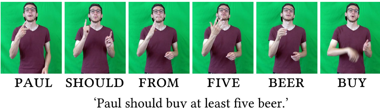
Figure 5. Representative images depicting the neutral use of 'at least', which does not require any obligatory non-manual markers. Note that movements of the mouth are related to mouthings.

performs a downward movement. All signers stated that they know the sign, but most stated that they would not use it in everyday signing.