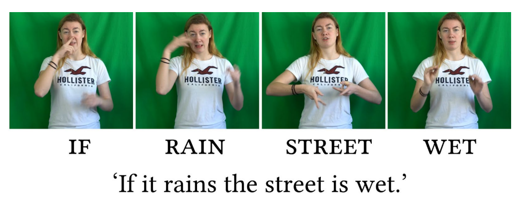
Figure 4. Conditional clauses are marked with a brow-raise accompanying the whole clause; optionally, a clause-initial manual conditional marker can be used.

same is true for evaluation, which is thought of as being encoded in a functional projection in the CP-domain (e.g., Cinque, 1999). Similarly, concessive although is an example of a subordinator and, thus, should be located in the CP-layer.<sup>2</sup> Only qualifications have an unclear categorical status. Nevertheless, qualifications seem to be a speaker/signer-oriented category rendering a CP-analysis likely, although this remains a speculation. Finally, conditional clauses also exhibit a connection to the left periphery (i.e., to the CP-layer) since they instantiate cases of embedding where the embedded structure has a CP-field.