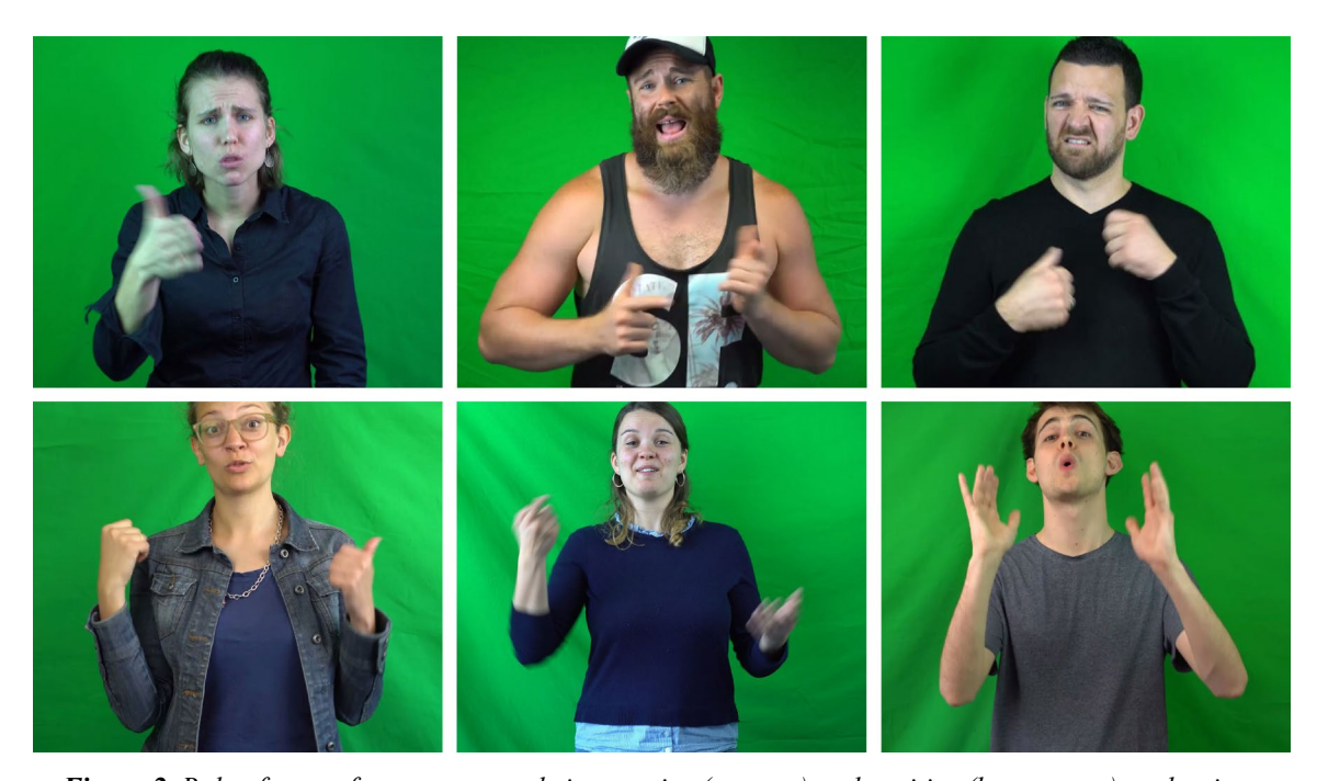
Figure 2. Role of upper face non-manuals in negative (top row) and positive (bottom row) evaluations.

In DGS, concessive 'although' is expressed via the same lexical sign used for coordinative 'but'. However, while the sign BUT is not accompanied by non-manual markers, the sign ALTHOUGH is